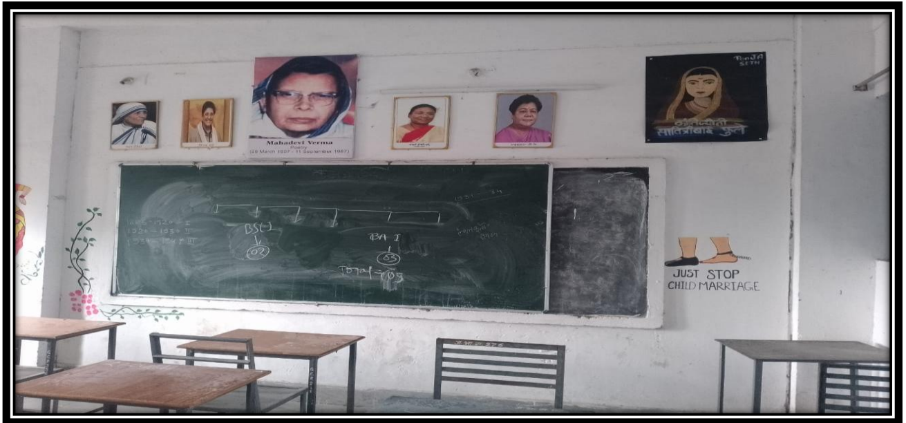
Girls Common Room